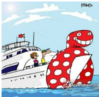
"Yes, Mom, boating safety is important, however, a giant floaty is a little embarrassing."

Please come have dinner with your boating friends in November!!